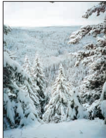
Above: View of Baker Creek Canyon from south trail loop.

The authors of the Cariboo Chilcotin Adventure Guides have tried hard to provide up to date, accurate information. However, no guide is perfect and no responsibility is accepted for any discrepancies or lack of precision. Also, users of the Cariboo Chilcotin Adventure Guides agree to waive any and all claims against the authors and staff for personal injury or mis-adventure while undertaking any outdoor recreation activity. Make sure you evaluate your ability in relation to the risks and challenges. Be prepared for weather changes, bring first aid gear, go with a friend(s) , and leave a copy of your trip plan with someone you trust.