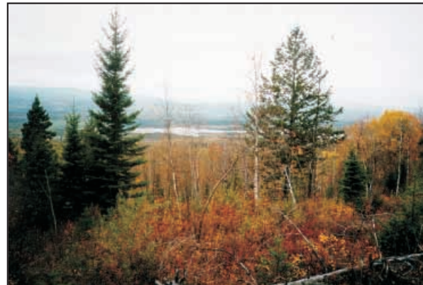
Looking west to Dragon Lake from viewpoint - Loop 7

The Cariboo Ski Touring Club relies on the work of volunteers, donations and memberships to maintain the Hallis Lake trail network and facilities. Please help the Club maintain this high caliber facility by making a donation (donation box in lodge) or becoming a member.