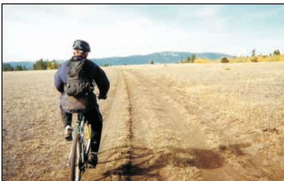
Heading east on access road - Bald Mtn visible in distance

From Beaumont Road, follow the dirt access trail west through open range land for about 3 km, passing through two gates (keep them closed). Continue across a small irrigation ditch (can be forded on foot or bike) to a small corral where the road passes through one more gate and turns southwest to the trail head, about 1 km further along. The access trail/road ends in a semi-open fir forest on the plateau above the lake (look for the fisheries sign on a tree). The main trail down to the lake begins at the end of the road and the trail head is easily visible. You may also notice a new trail heading west along the rim of the old volcano - this short trail offers a great viewpoint of the lake. Leave your mountain bike at the hiking trail head since the trail is too steep to ride up. The trail switchbacks down along the east side of the lake and provides some nice views. Just above the lake, the trail branches with one leg heading direct to the lake and access for launching inflatable boats or float tubes. Although the lake has been stocked by BC Environment, the fish are rather savvy and hard to catch. The other trail continues south onto a ridge line above the lake and provide access to a small camping area and the west side of the lake. Numerous opportunities exist for more exploring off-trail in this semi-open country.