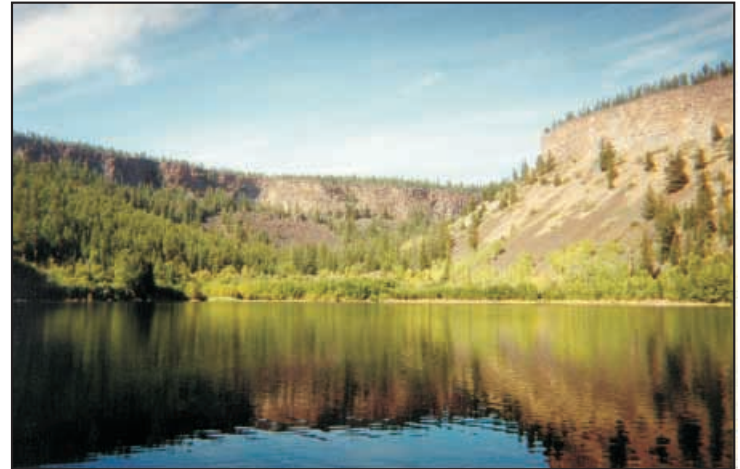
View of Dantes Inferno-looking north