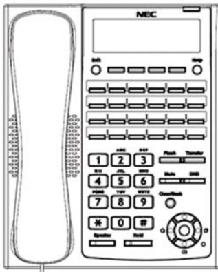
24 Button IP Tel