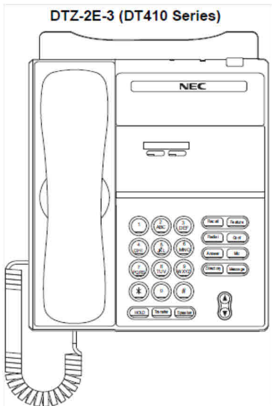
DT410 (2-button without LCD)